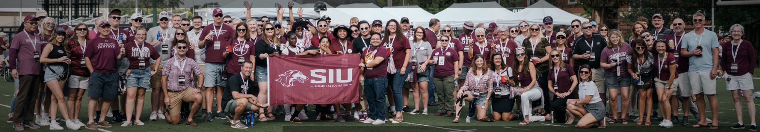
Alumni Tailgate | SIU vs. Northwestern

INVESTED IN ALUMNI AND STUDENT ENGAGEMENT EVENTS AND PROGRAMS LAST YEAR.