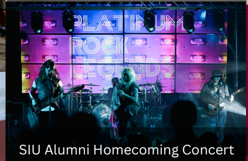
SIU Alumni Homecoming Concert