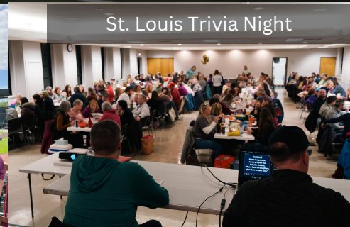
St. Louis Trivia Night