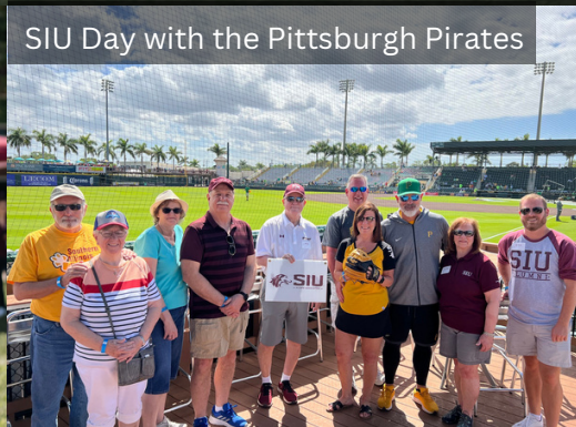
SIU Day with the Pittsburgh Pirates