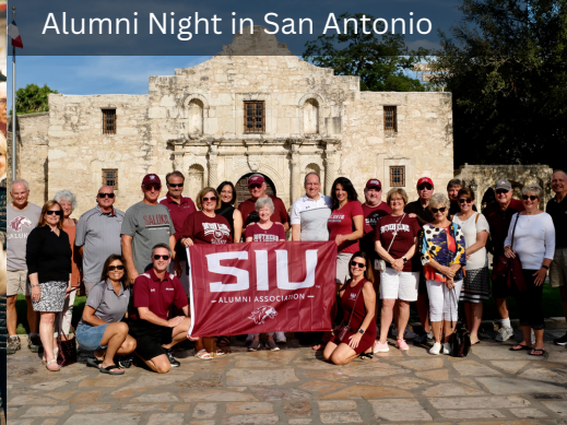
Alumni Night in San Antonio