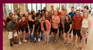
SIU YOUNG ALUMNI GROUP INNOVATION AWARD