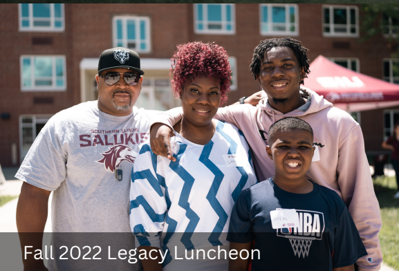
Fall 2022 Legacy Luncheon