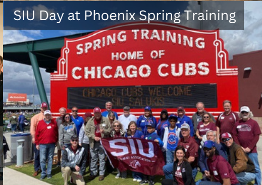
SIU Day at Phoenix Spring Training