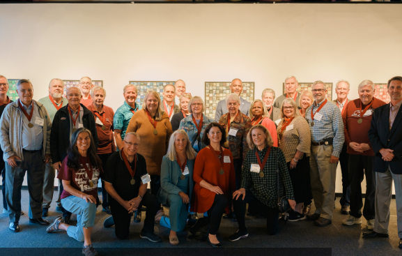
50-Year Reunion | Class of '72