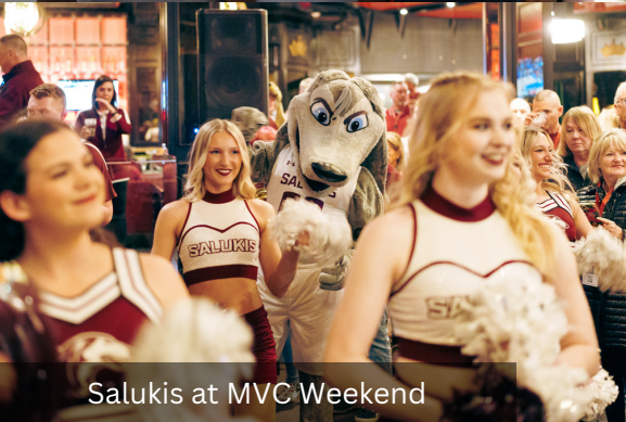
Salukis at MVC Weekend