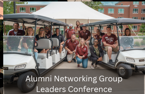
Alumni Networking Group Leaders Conference